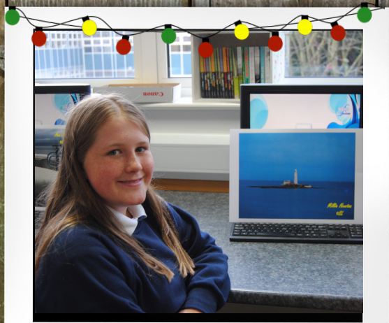
Year 9 Photography Competition

We challenged Year 9 students to send in photographs of beautiful scenes they saw around Whitley Bay. This turned out to be extremely popular and we had over 100 individual entries! The finalists then had their work displayed in a gallery. The winners will be announced in the end of term assembly.