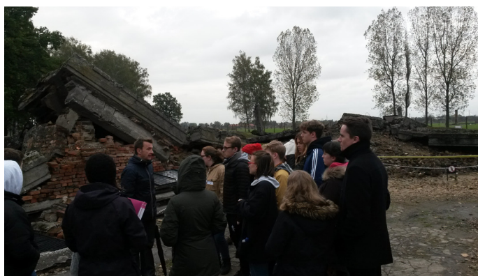
Ruins of gas chamber